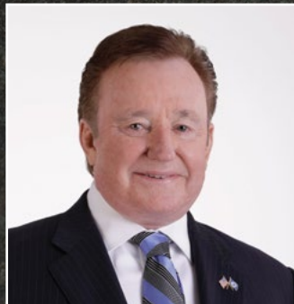
Richard Childress CEO, Richard Childress Racing