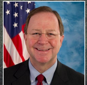
Bill Flores U.S. Congressman (TX-17)

Kicking off the 40 th year of “God Bless the USA”