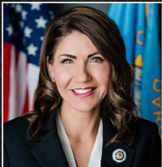
Kristi Noem South Dakota Governor