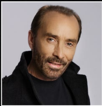
Hosted by Lee Greenwood

December 2, 2020 5:30 PM – Reception & Silent Auction 7:00 PM – Dinner & Program The Woodlands Waterway Marriott Cocktail Attire